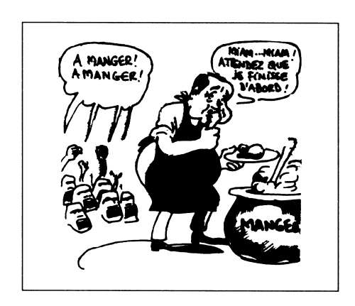
The people cry, "We want to eat! We want to eat!" "Yes, yes," rumbles the autocrat. "Wait until I've finished first!"