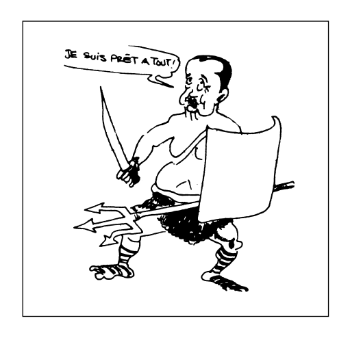
FIGURE 13 The autocrat appears as a traditional warrior, but prepared to cut off any recalcitrant subject's head. "I am ready for anything."