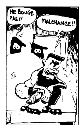
FIGURE 22 The subject is caught in an act of vengeance: "Don't move." "Bad luck."