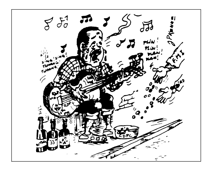
FIGURE 2.1 FMI = IMF (International Monetary Fund) BIRD = IBRD (World Bank)

from arrangements that the cartoonist evokes superbly. First, power is produced and exercised in an embodied form. The constancy of the weight of the various organs and their modulations, those intensive regions and sites of lechery forming the digestive system and its components (the mouth, the jaw and teeth, the esophagus, the intestine, the anus and its products), the network of venal values symbolized by the penis, the ingestion-excretion-defecation circuit, together constitute identifiable properties of the "thing."