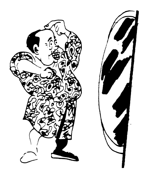
There can be no view of the autocrat not his already.

above all, this capacity for proliferating substitution, the autocrat is also a "thing." His "thing-ness" lies in that, in part, he is a subjective image that surrounds one, and with which one has dealings, and that one can represent for oneself and, so to speak, take around inside oneself. This image is also exchanged. And, in the exchange, each time it becomes "truer"—that is, that "something that is not nothing," something empirical.