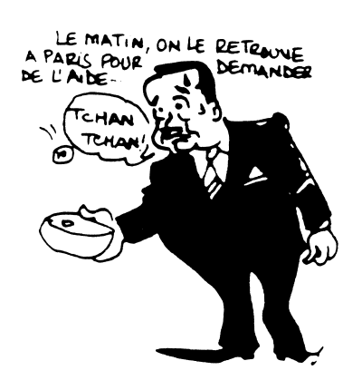
FIGURE 19 He is obsequious; he begs. "Any change? Any change?"

breaks everything around him, curses the Good Lord, humiliates his lackeys, and cusses all around.