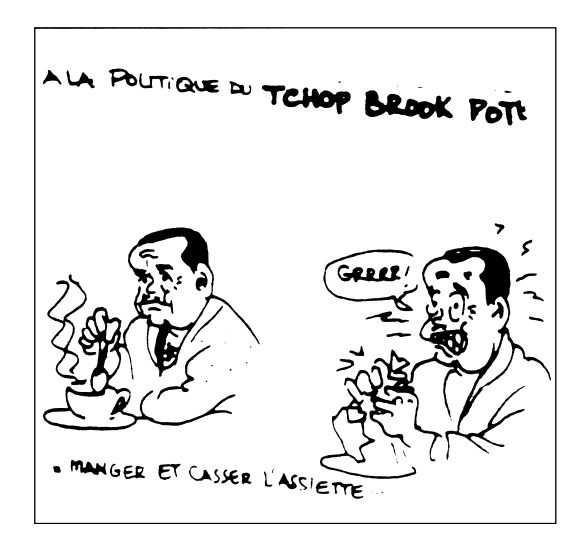
FIGURE 16 The politics of "chop brook pot" are summed up: "Grrr!" The tyrant eats and smashes the plate.