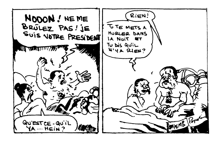
FIGURE 6 Sitting up still asleep, the autocrat cries, "Nooo! Don't burn me! I'm your president."