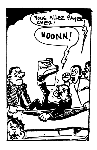
FIGURE 5 "You'll pay for this!" the autocrat screams, then, in panic, "Nooo!"