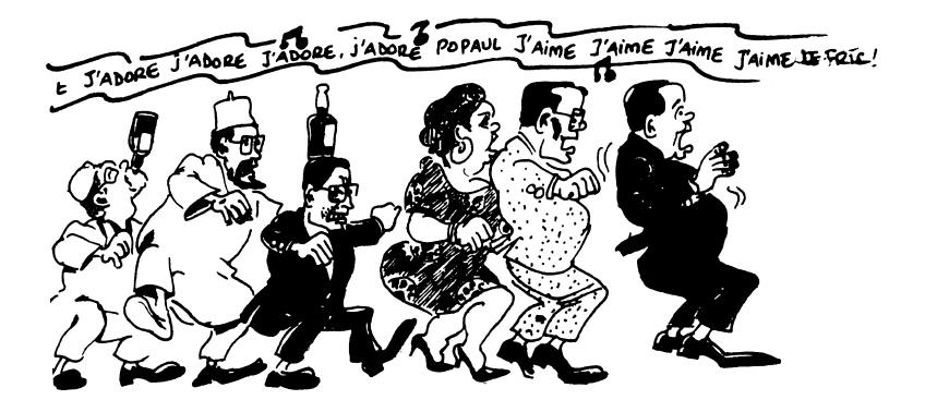
FIGURE 20 The autocrat leads his sycophants in grateful dance: "I adore, I adore, I adore, I adore Popaul, I love, I love lolly." Subjection can get transformed into a magical song.

the autocrat is full of thanks, proclaiming his gratitude to all and sundry, and leading his sycophants in an interminable dance.