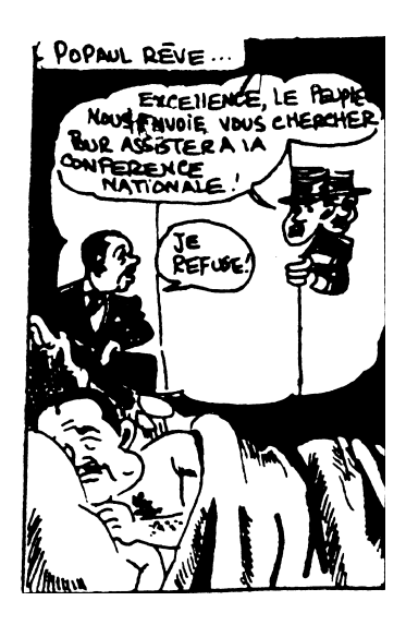
FIGURE 1 Popaul is dreaming: "Excellency, the people have sent us to get you to attend the national conference." "I refuse!"