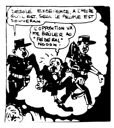
FIGURE 2 In the autocrat's dream, two soldiers drag him to the assembly: "Terribly sorry, Excellency, but as things are now, only the people are sovereign." "The opposition is going to burn me at the 'Federal.' Noooooo!"