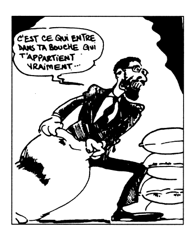
FIGURE 12 Since "It's what gets into your mouth that really belongs to you!" one steals, one laughs, one spends.

nation, from the ugliness of the real world and the dread of mediocrity and irresponsibility.