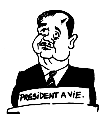
FIGURE 8 The autocrat is there "for life."

form a citizen may wear, his name on the stadium, the airport, or the main avenue of the capital. He doesn't just appear in facts, events—in short, in news. He tends to be omni-present.