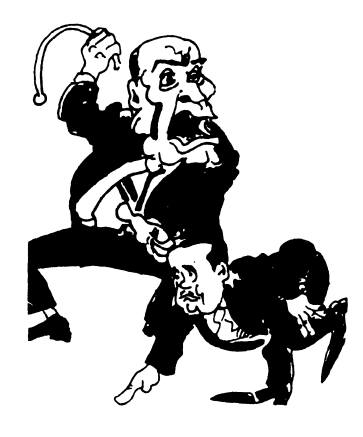
FIGURE 18 One morning, here the autocrat is in Paris to ask for aid. But alms have a price.