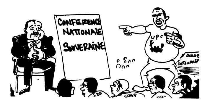
As the autocrat's dream continues, the Sovereign National Conference, acting as a tribunal, presents the "grievances of the street."