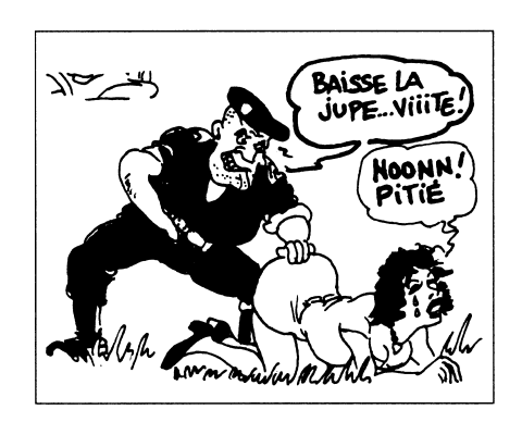
FIGURE 11 "Drop your skirt . . . quiiick!" "No! Pitv!"

for me, I just laugh." They talk endlessly, too. They pour out their feelings, and sometimes they fight. They borrow money. They give way, the better to take advantage. They make themselves understood from what is not openly said or shown. They endeavor, as it were, to make visible what, a priori, does not possess visibility.