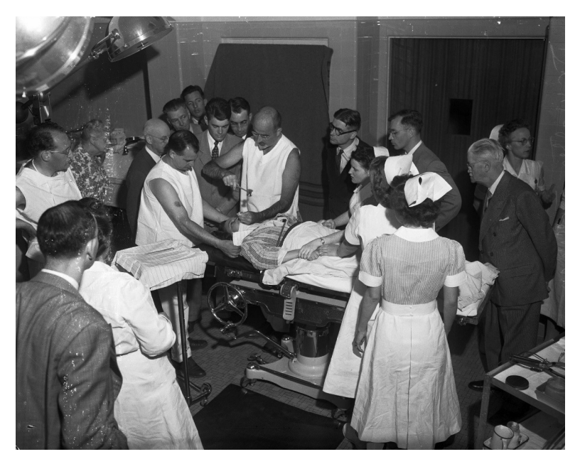
5 Walter Freeman performing a leucotomy in 1949

The prefrontal leucotomy was introduced by Egas Moniz in 1936 for aggressive or seriously disturbed patients.<sup>70</sup> However, this was popularised by an American neurologist Walter Freeman (pictured in figure 5) in collaboration with neurosurgeon, James Watts.<sup>71</sup> They published a book called Psychosurgery in 1942 that detailed the preoperative care, operative technique and post-operative care.<sup>72</sup> There had been a paucity of academic discussion regarding psychosurgery in Britain prior to 1942, when eight patients were operated on, the first of whom had a leucotomy preformed in Bristol in December 1940.<sup>73</sup> The Lancet published the results of these procedures in July 1941