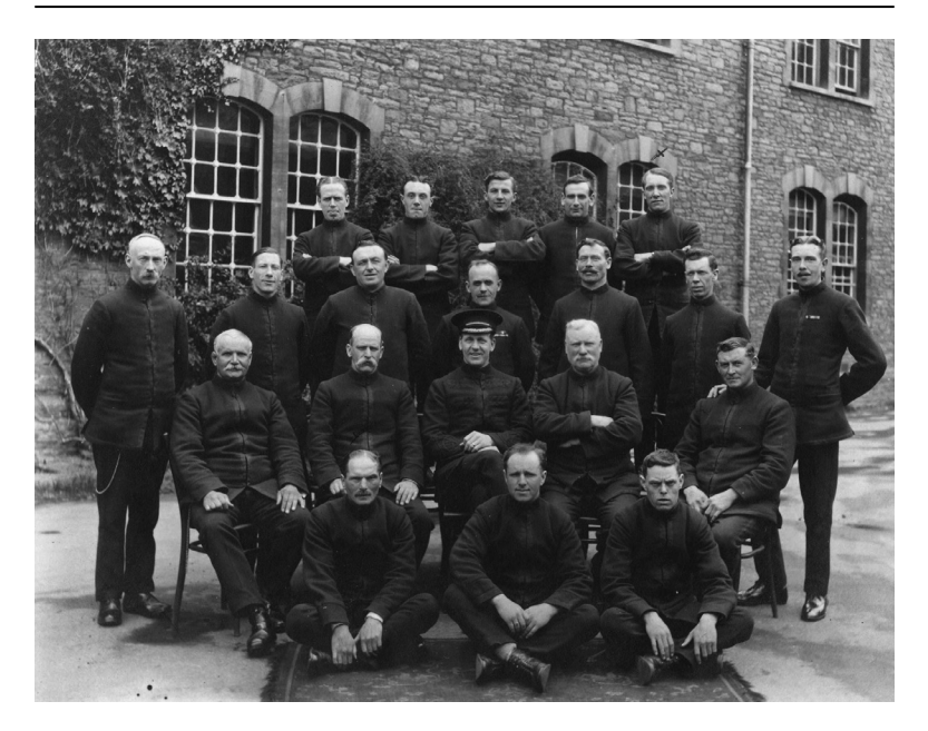
1 Male attendants at Bristol Lunatic Asylum, circa 1910s

At the end of 1919, the Nurses' Registration Act for England, Scotland, Wales and Ireland received royal assent. This established a register for general nurses with supplementary sections for other groups, including 'mental nurses,'<sup>156</sup> and at the end of 1919, nursing registration became enshrined in law.<sup>157</sup> Then, in 1920, the General Nursing Council (GNC) agreed to accept holders of the MPA's Certificate in Nursing the Insane, as eligible for admission to the supplementary register for a 'period of grace'.<sup>158</sup> In the early 1920s, the GNC also set up their own alternative qualification, and the first cohort of mental nurse trainees sat the GNC's examination in 1922.<sup>159</sup>