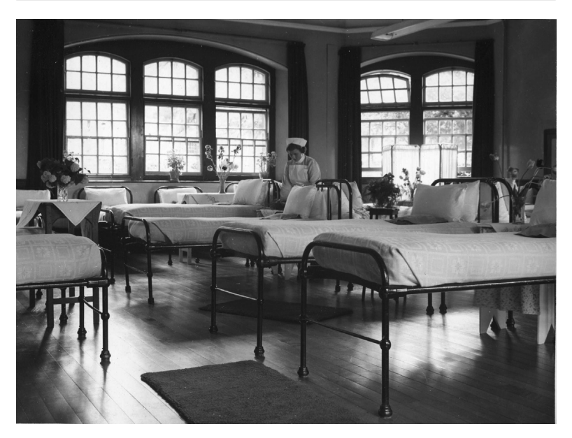
8 Female ward c.1960s

Despite the ward in figure 8 looking rather institutionalised with the beds all in line, there is some attempt to domesticate it with the flowers arranged around the ward.