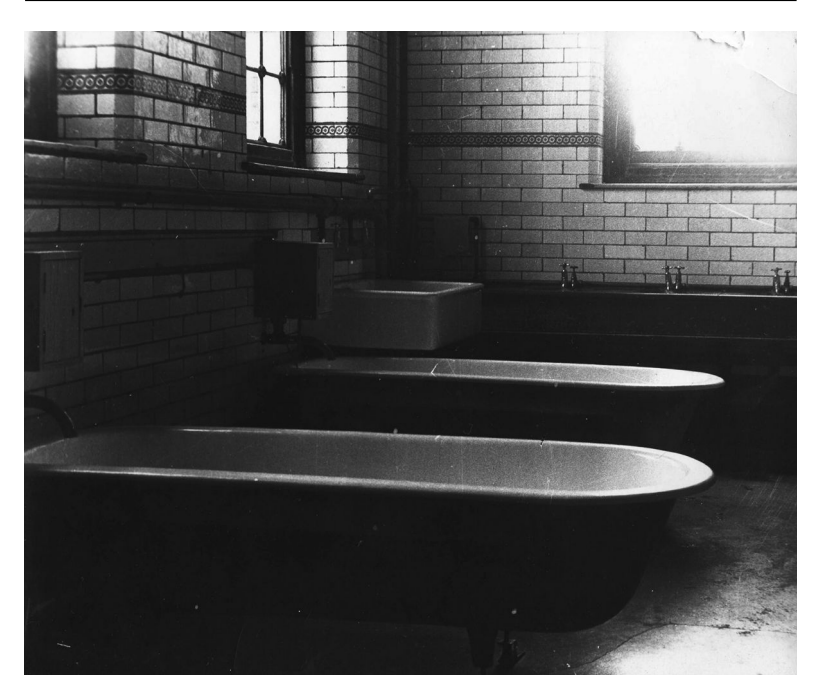
Work and practice of mental nurses, 1930–1959