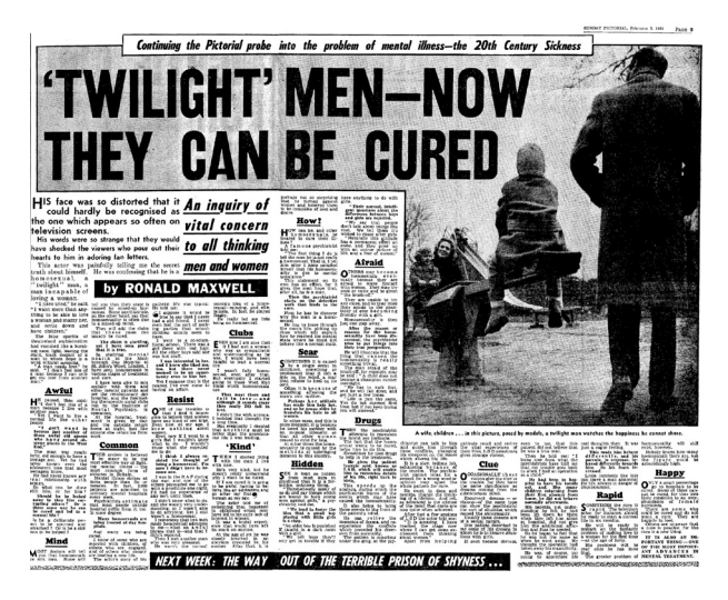
3 The Sunday Pictorial: "Twilight" [homosexual] Men – Now They Can Be Cured'

[homosexual] Men – Now They Can Be Cured' (see Figure 3),<sup>200</sup> thus reinforcing the notion that homosexuality was an illness that could be cured. It is interesting to note that the Sunday Pictorial article used an image of a 'twilight' man looking furtively at children playing in a park, with the tagline: 'A twilight man watches the happiness he cannot share.' Arguably, this accentuated the familiar stereotype that homosexuals had paedophilic tendencies.