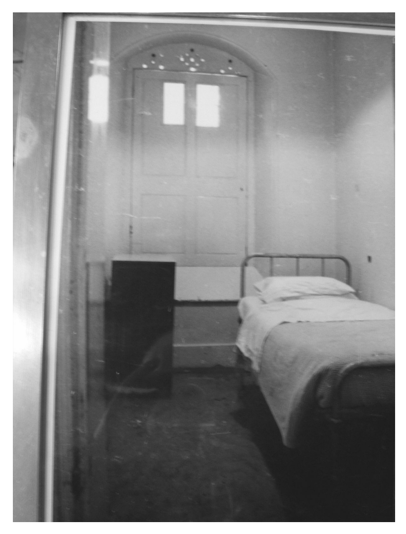
2 Side-room at Glenside Hospital, Bristol

that there was a complete change from homosexual to heterosexual behaviour. This paper displays a mixture of techniques involved in this treatment, without any discussion of the research base underpinning them.