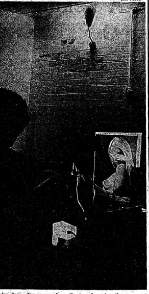
rim decor for one male patient undergoing the cur

therapy for homosexuals has raised the inevitable ethical out cries of whether homosexual